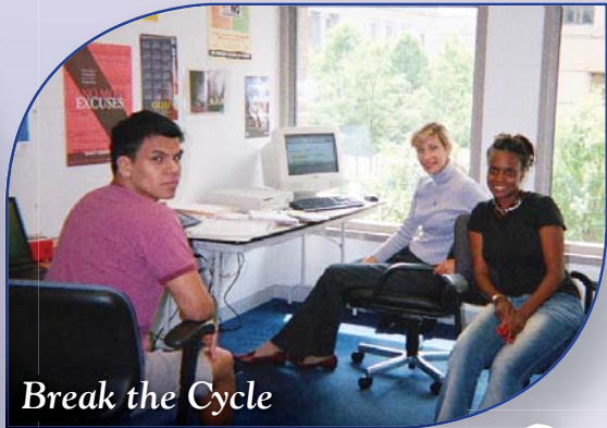
Break the Cycle