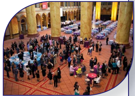
2012 Annual Dinner